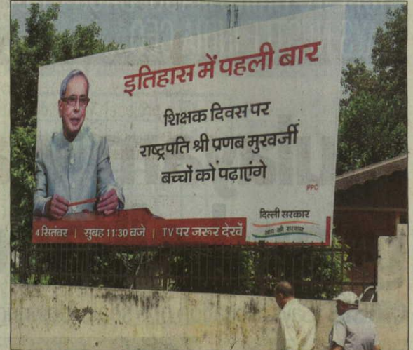
■ The Delhi government has put up hoardings to inform people about the President's Teachers' Day programme.

Meanwhile, HRD Minister Smriti Irani on Thursday presented CBSE awards to 34 teachers ahead of the national Teacher's Day celebrations on September 5.